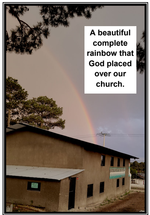
A beautiful complete rainbow that God placed over our church.